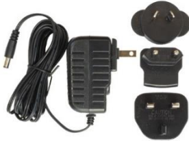
Figure 5: PWR-ACDC-5V2A