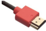
Figure 3: HDMI Cable