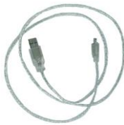
Figure 4: EXTMUSB3FT